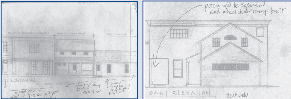
Above: Annotations over existing drawings to show proposed porch extension

The project is expected to take 3-6 months to complete. Sponsor has begun conversations with vendors and does not expect significant permits required.