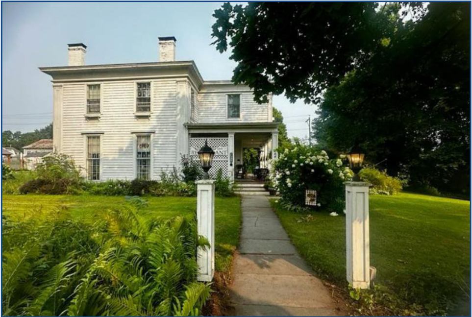
Above: Existing entrance