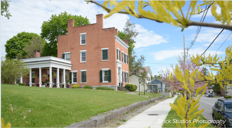
Above: Existing main house facing Broad St