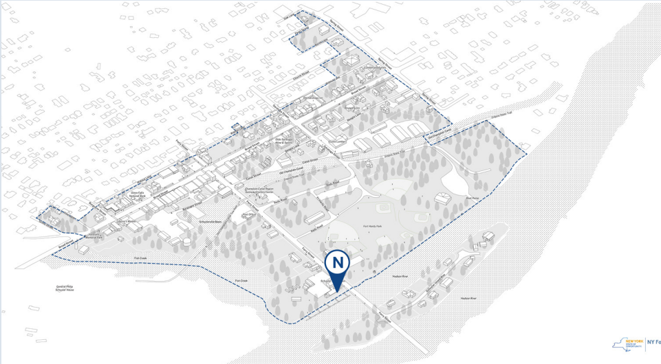
Location: 1 Ferry Street