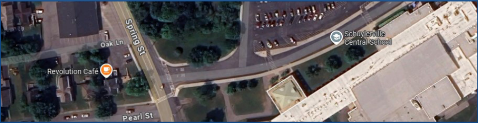
Above: Revolution Cafe and Schuylerville Central School