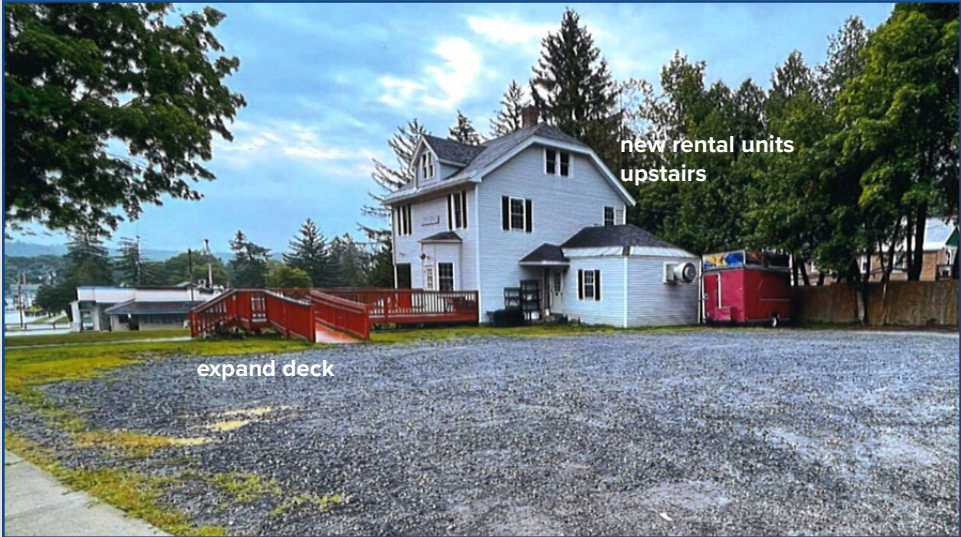
Above: Existing cafe and parking lot

This project is in the conceptual phase with the majority of funding secured.