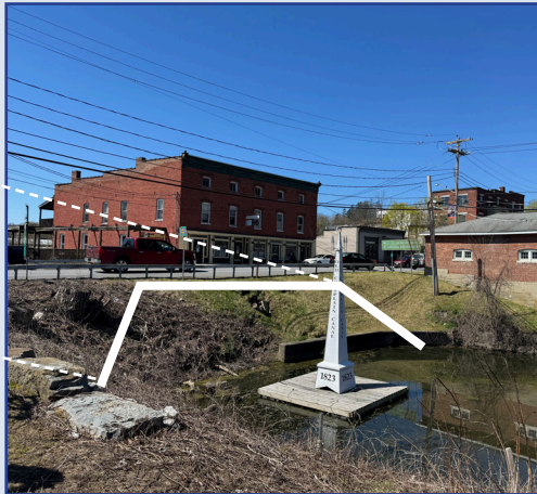
Above: Example box culvert crossing, with diagram of proposed location over photograph of existing condition