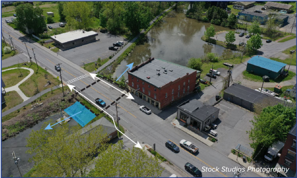
Above: Aerial diagram showing area of work, highlighting pedestrian and water connections to be improved

The vision to open the Old Champlain Canal for recreation has been a consistent recommendation in local and regional planning initiatives for nearly 25 years. The Village is planning to complete the project before the 250th celebration.